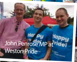
John Penrose MP at Weston Pride